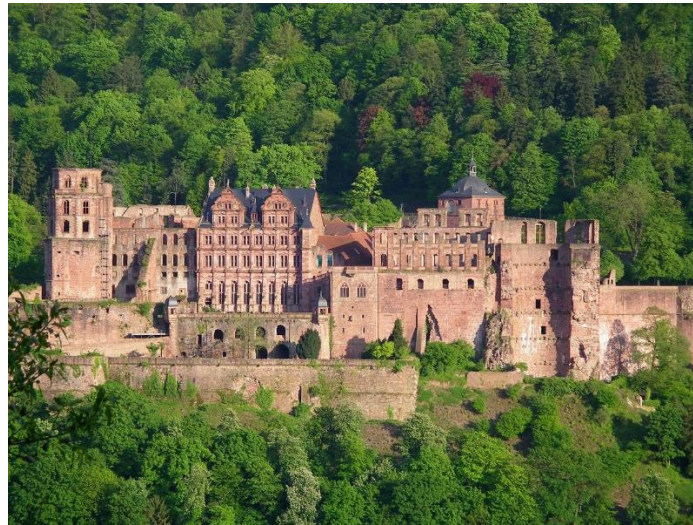
Figure 1. For images, be sure to have a good resolution. Please note that the words "Figure" or "Table" should be spelled out. Arrange the figure centred on the page

You can also use graphs or images. Captions should be numbered e.g. "Table 1" or "Figure 2"